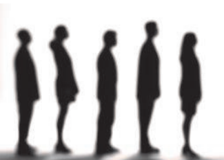
Potential queue for free spleens

UNIVERSAL healthcare has been OK'd in the US, giving the right for millions to moan about waiting lists.