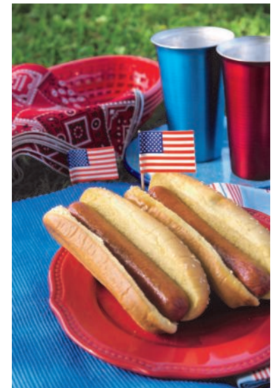
Hot Dog! Conciliatory cuisine prepared by top US chefs—hash browns cost extra

However, in the US the routin' tootin' 4th July festivities continued as normal with fireworks, handgun swap-meets and the burning of British English dictionaries.