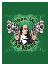
Not a sniff...

"I had almost 500 words already written about American nihilistic gun culture but did I see any drive-bys? Did I balls," he harpooned.