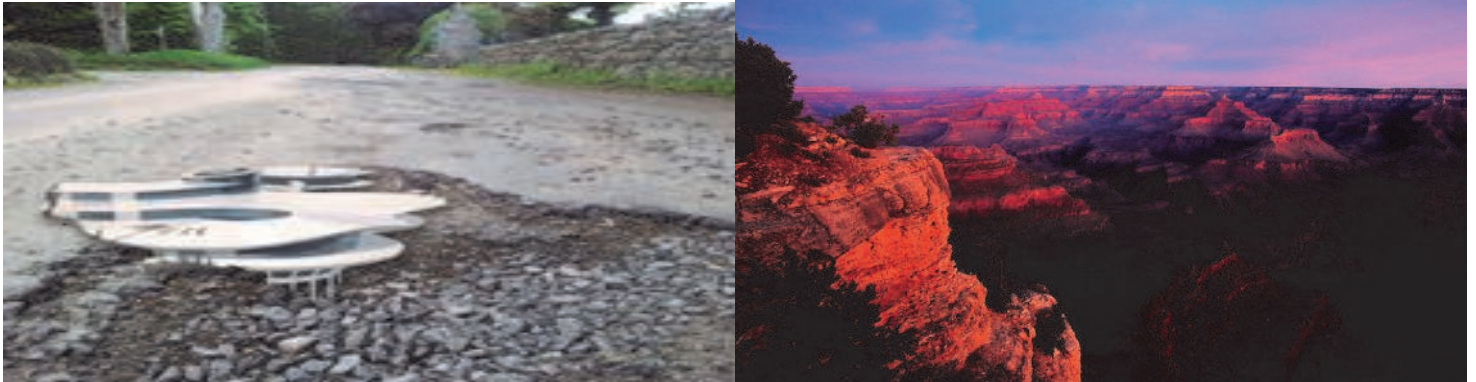
The worlds biggest hole (L) containing its largest ground crack/visitor centre plan, and the miles-wide American stunner (R)